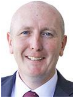
Hon Stephen N DAWSON MLC

13th Floor, Dumas House 2 Havelock Street, WEST PERTH WA 6005 Phone: (08) 6552-5700 / Fax: (08) 6552-5701 e-Mail: Minister.Ellery@dpc.wa.gov.au