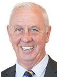
Hon Francis M LOGAN BA(Hons) MLA

11th Floor, Dumas House 2 Havelock Street, WEST PERTH WA 6005 Telephone: (08) 6552-6200 / Fax: (08) 6552-6201 e-Mail: Minister.MacTiernan@dpc.wa.gov.au