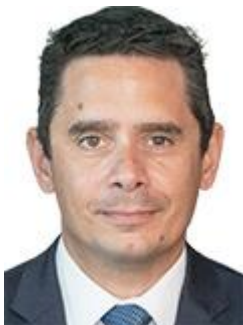
Hon Ben S WYATT LLB MSc MLA

7th Floor, Dumas House 2 Havelock Street, WEST PERTH WA 6005 Telephone: (08) 6552-6400 / Fax: (08) 6552-6401 e-Mail: Minister.Murray@dpc.wa.gov.au