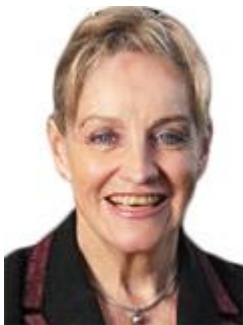
Hon Alannah MacTIERNAN MLC

12th Floor, Dumas House 2 Havelock Street, WEST PERTH WA 6005 Telephone: (08) 6552-6900 / Fax: (08) 6552-6901 e-Mail: Minister.Roberts@dpc.wa.gov.au