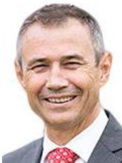
Hon Roger H COOK BA GradDipBus MBA MLA

1 Parliament Place WEST PERTH WA 6005 Telephone: (08) 6552-5000 / Fax: (08) 6552-5001 e-Mail: wa-government@dpc.wa.gov.au