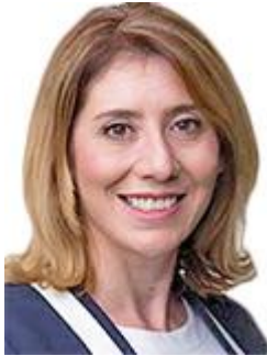
Hon Rita SAFFIOTI BBus MLA

9th Floor, Dumas House 2 Havelock Street, WEST PERTH WA 6005 Telephone: (08) 6552-6700 / Fax: (08) 6552-6701 e-Mail: Minister.Johnston@dpc.wa.gov.au