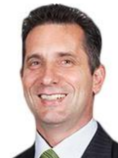
Hon Paul PAPALIA CSC MLA

11th Floor, Dumas House 2 Havelock Street, WEST PERTH WA 6005 Telephone: (08) 6552-5900 / Fax: (08) 6552-5901 e-Mail: Minister.Wyatt@dpc.wa.gov.au