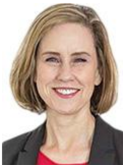
Hon Simone F McGURK BA(Arts) BA(Comms) MLA

7th Floor, Dumas House 2 Havelock Street, WEST PERTH WA 6005 Telephone: (08) 6552-5300 / Fax: (08) 6552-5301 e-Mail: Minister.Tinley@dpc.wa.gov.au