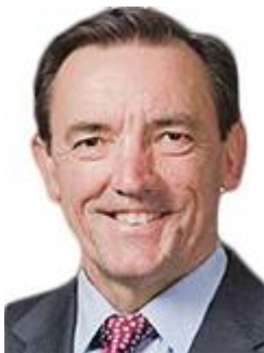
Hon Peter C TINLEY AM MLA

9th Floor, Dumas House 2 Havelock Street, WEST PERTH WA 6005 Telephone: (08) 6552-5500 / Fax: (08) 6552-5501 e-Mail: Minister.Saffioti@dpc.wa.gov.au