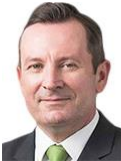
Hon Mark McGOWAN BA LLB MLA

Listed below is the current WA Government Ministry. Clarity is being sought on which Ministers WARCA would most like to meet with during 2017.