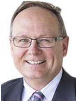
Hon David A TEMPLEMAN Dip Tchg BEd MLA

Minister for Local Government; Heritage; Culture and The Arts