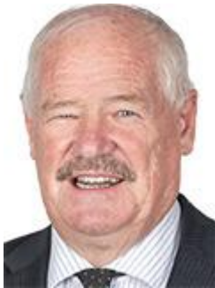
Hon Mick P MURRAY MLA

10th Floor, London House 216 St Georges Terrace, PERTH WA 6000 Telephone: (08) 6552-6800 / Fax: (08) 6552-6801 e-Mail: Minister.Quigley@dpc.wa.gov.au